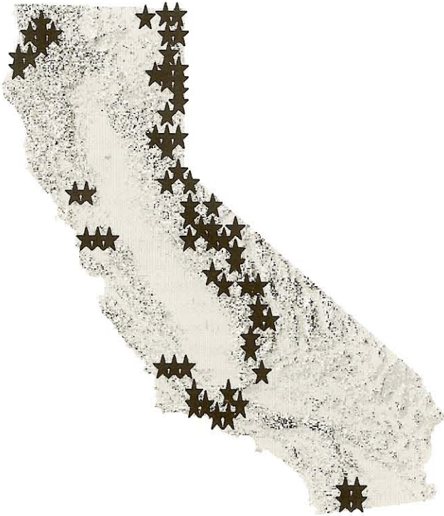
FIGURE 1. Sites located across the State indicated by stars.

USDI-BLM, and USDA-NRCS we are currently conducting a state-wide cross-sectional survey to: 1) identify and quantify grazing management and site characteristics associated with high and low "riparian health" or habitat quality; 2) analyze and synthesize data for site specific recommendations; 3) extend this information to grazing managers and; 4) develop a set of case studies to evaluate our recommendations over time. The objectives of this paper are to: 1) report on the preliminary results of this project; 2) generate interest in the conference participants and readers to capitalize on the knowledge base available on real world grazing systems.