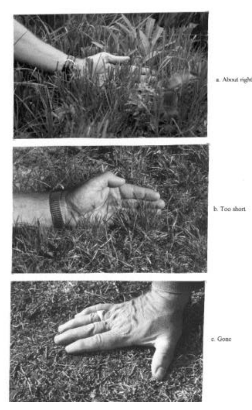
Fig. 2. The suggested stubble height is similar to the width of one's hand. a. About right, b. Too short, c. Gone.

trampling of streambanks, sustaining forage intake and cattle gains, and diversion of willow browsing—taken as a whole. We recognize that any given height can be satisfactory for some processes and less so for others. Therefore, no single height will likely be optimal for all riparian processes. It appears, however, that the 10 cm height may be the best compromise in many situations.